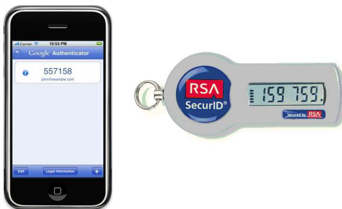
Figure 4.2: The Google Authenticator app is one popular example of a one-time password scheme using pseudorandom functions. Another example is RSA's SecurID token.

As we will see it's not really crucial that the input i (which is known in crypto parlance as a nonce ) is random. What is crucial is that it never repeats itself, to foil a replay attack. For this reason in many applications Alice and Bob compute i as a function of the current time (for example, the index of the current minute based on some agreed-upon starting point), and hence we can make it into a one message protocol. Also the parameter \ell is sometimes chosen to be deliberately short so that it will be easy for people to type the values y_1, \dots, y_\ell .